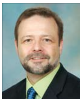
Axel Grothey, M.D.

Previous studies have demonstrated that fit, elderly metastatic colorectal cancer patients benefit from combination treatment with fluoropyrimidine and oxaliplatin (FOLFOX and XELOX) chemotherapy. Yet, the majority of cancer research historically has been conducted on younger patient groups, with elderly patients being significantly underrepresented in clinical trials. Clinical trial N0949 will fill an important need by providing efficacy and toxicity data of regimens used in current day practice for the growing under-represented population of elderly patients with metastatic colorectal cancer. The trial opened in January 2011, with projected accrual of 380 patients in the United States.